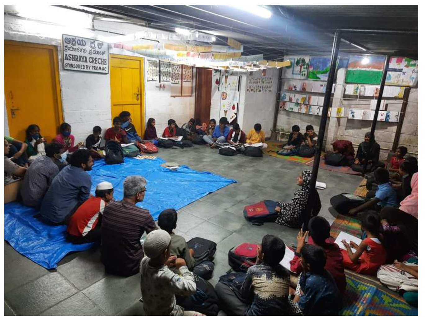
Discussions with local anganawadis