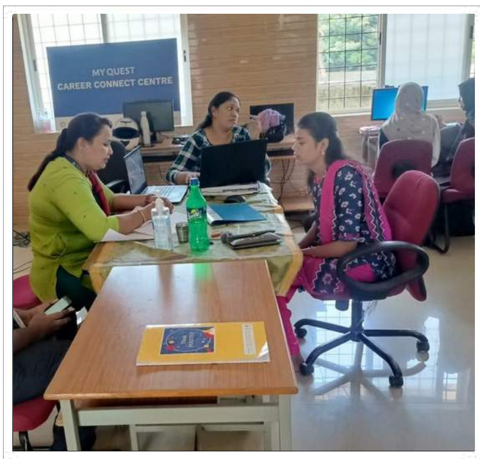
Physical Job Drive