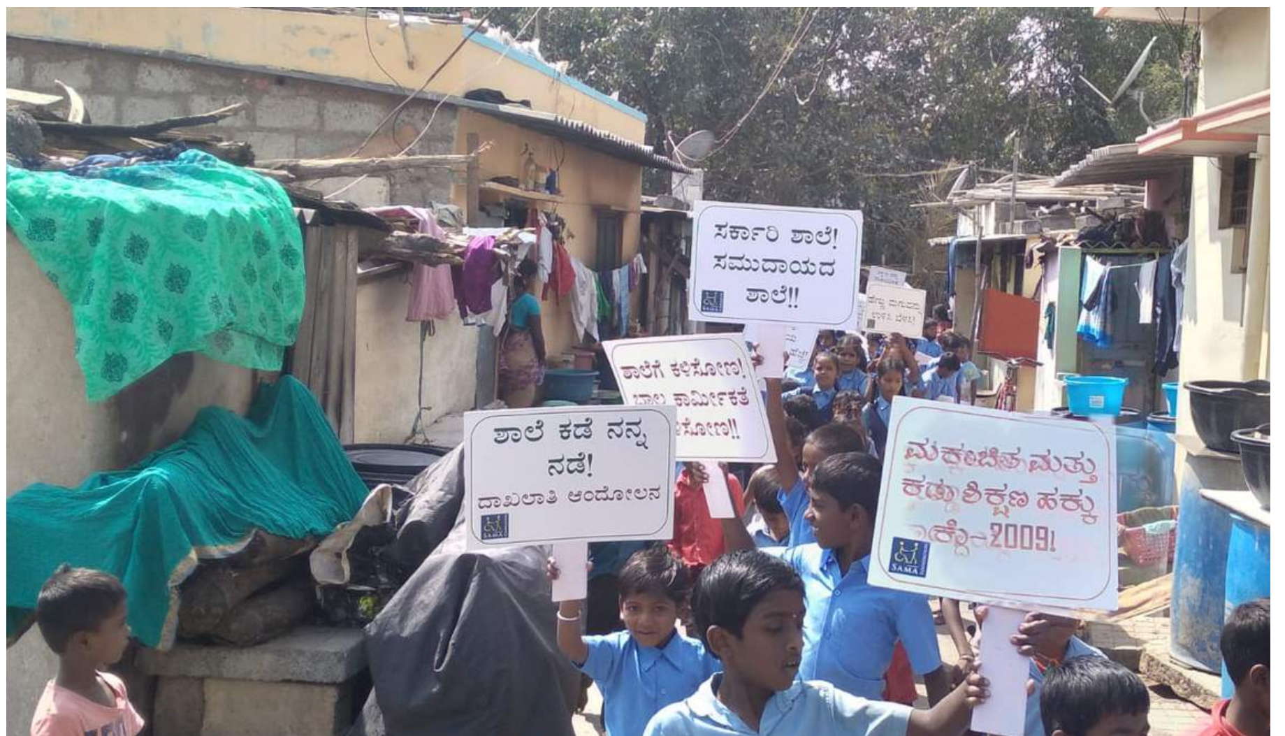
Conducted school enrollment programmes